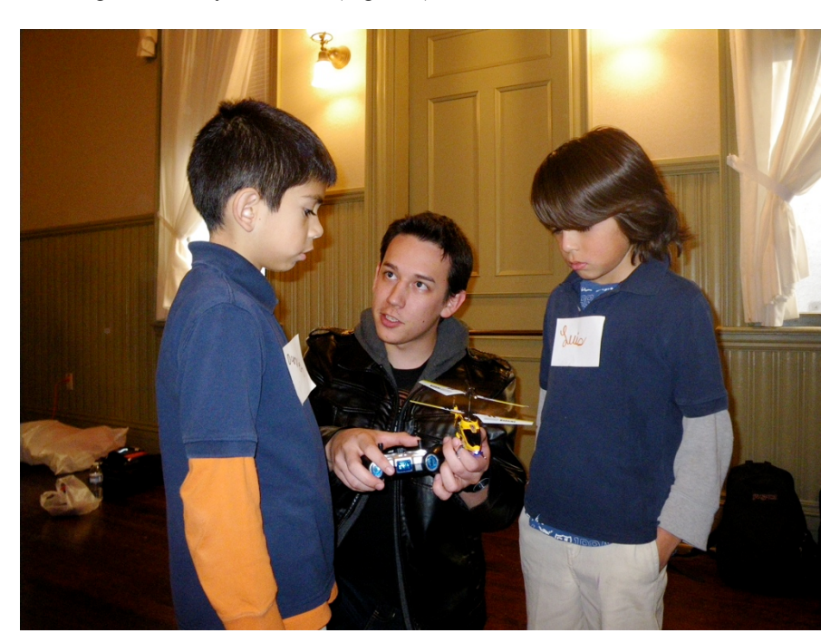
Figure 1: An AE student gives flight instruction to two 4<sup>th</sup>-graders, who are about to fly a radio-controlled helicopter.