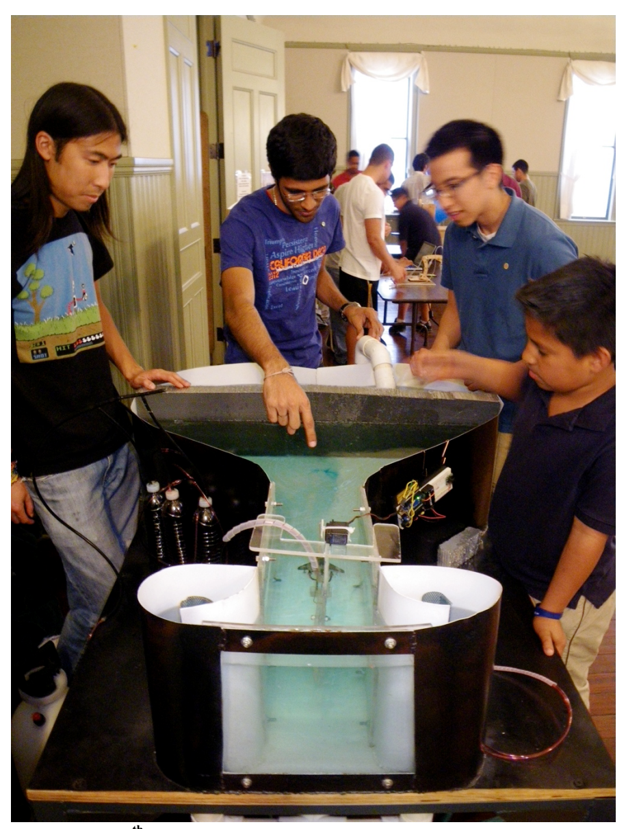
Figure 2: A 4<sup>th</sup>-grader observing the flow streamlines around a model airplane in a portable water tunnel.