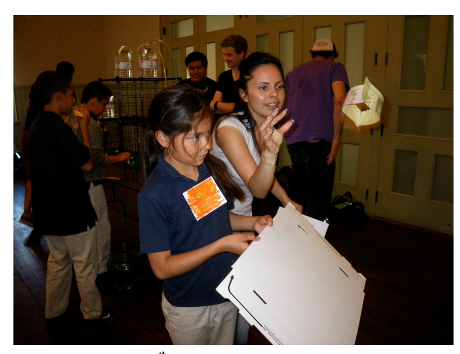
Figure 3: A 4<sup>th</sup>-grader flying a circular wing glider.