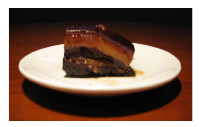
Fig. 17.7. A piece of Dong-Po Pork. [Photograph taken by Lui Lam, at Grandma's Kitchen, Beijing, May 24, 2009.]

Works of Su Shi [Su, 2000, p. 1047], could be considered as a sort of "proof."