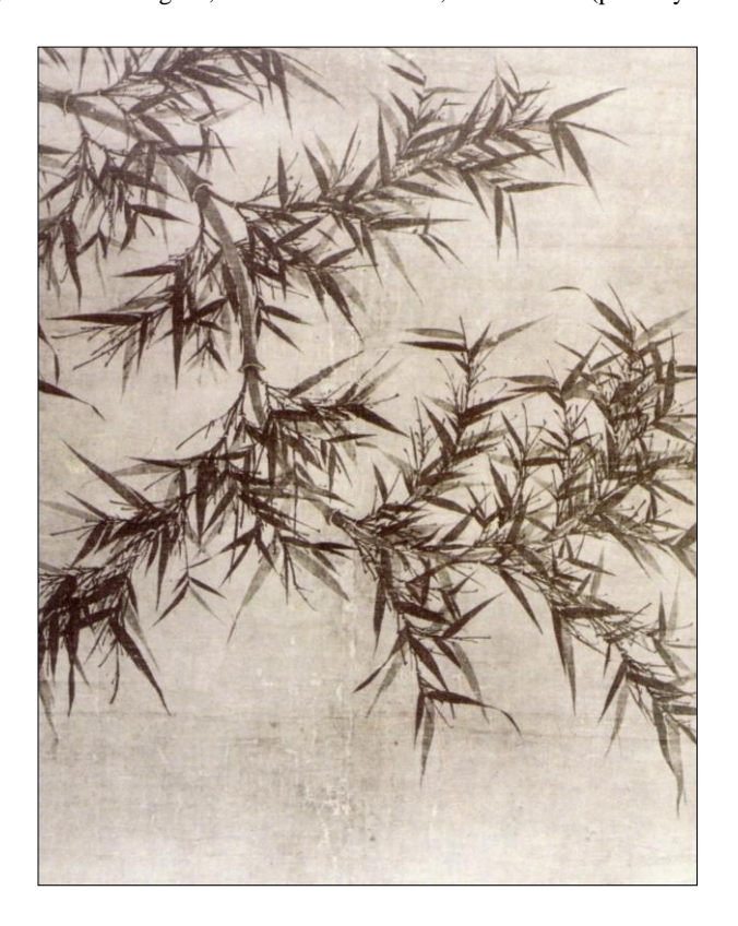
Fig. 17.2. Su Dong-Po, Bamboos and Stones, 106 x 28 cm (partially shown).