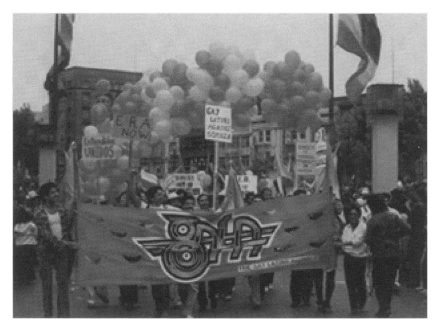
Figure 3. Gay Latino Alliance marching down Market Street in the 1977 San Francisco Gay Freedom Day parade.

the committee of their choice. The officers and most active members attended regular biweekly business meetings; a much larger group, numbering in the hundreds and not regularly involved in the business of the organization, attended GALA's parties. While GALA's public statements called for political change locally and internationally, it was the prominent live salsa orquestas or bands that kept hundreds of women's and men's bodies dancing in nighttime merriment. Politics and dancing mutually supported one another; the funds GALA raised through the dances and other social events underwrote political activism. After raising hundreds of dollars, GALA typically donated the money to local casas (aid organizations) that supported grassroots political efforts in Central America and to local Latino agencies working in the Mission District (Fig. 4, 5).