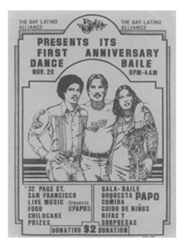
Figure 2. Gay Latino Alliance flyer for the first anniversary dance on November 20, 1976, at the Gay Center on Page Street.

political ideologies of the late seventies, which meant emphasizing racial and ethnic ties in gay and Latino public forums: in the Gay Freedom Day parade, during Cinco de Mayo, and at Carnaval festivals. Behind the organization's red and yellow banner usually came large, colorful flags of Latin American nations, cultural symbols alongside overtly political positions: "Gay Latinos Against Somoza," "Support Affirmative Action," "End Racism," "Puerto Rico Libre," "E.R.A. Now!"<sup>32</sup> While calling attention to social struggles elsewhere, GALA also highlighted local conditions in the Latino community (Fig. 2, 3).