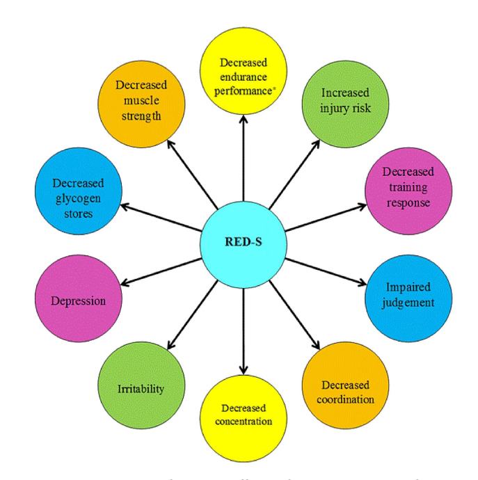
Figure 2 Potential Performance Effects of Relative Energy Deficiency in Sport (*Aerobic and anaerobic performance). Adapted from Constantini.<sup>54</sup>

electrolyte imbalances, and gastrointestinal problems, including esophagitis and oesophageal perforation from vomiting. Diuretics and some diet pills may contain WADA prohibited substances.<sup>58</sup>