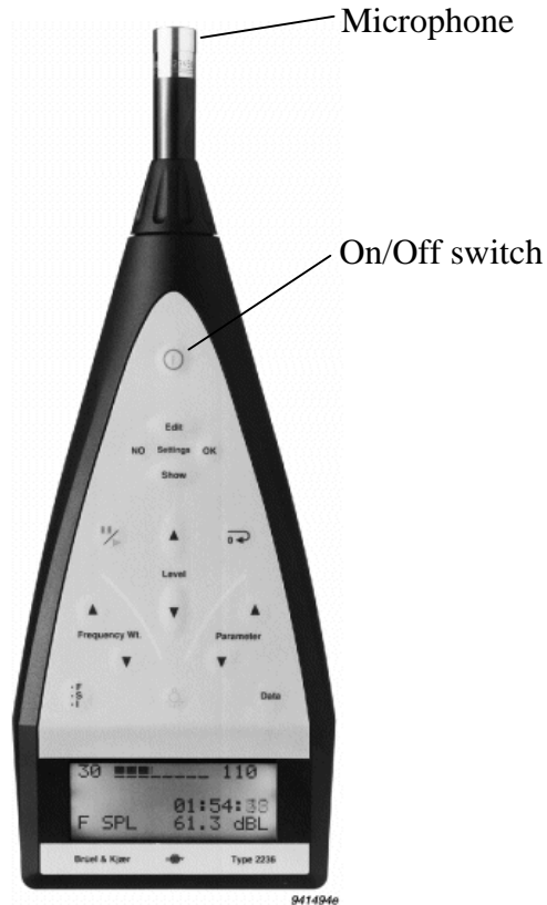
Figure 1. Brüel & Kjær 2236 Precision Integrating Sound Level Meter. The location of the microphone and on/off button are shown. The LCD display at the bottom shows the sound level reading (Brüel & Kjær, 2003).

to-digital converter where it is quantified digitally. The sound signal can then be filtered, measured and stored by the data acquisition systems introduced earlier in this manual