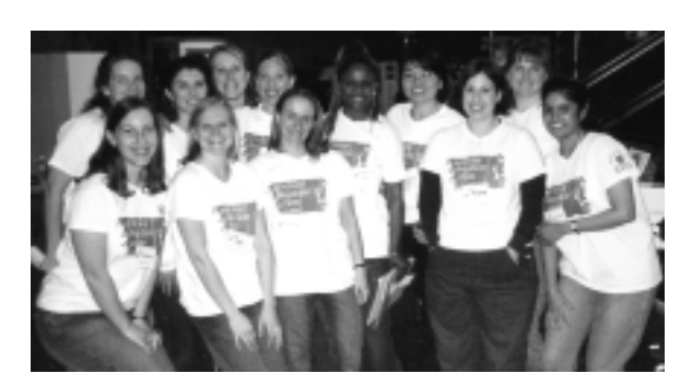
Nutrition Education Action Team (NEAT) pose after SJSU annual National Nutrition Month Fair