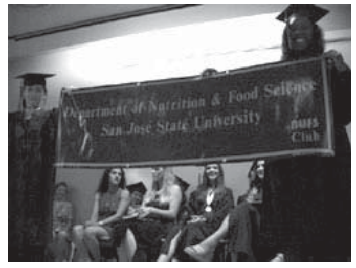
Thanks to this year's Student Club, the department now has its very own impressive banner, displayed above.