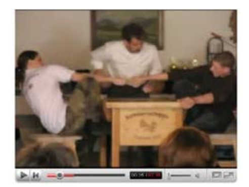
If you are interested in watching a Fingerhakelfight, feel free to check out: http://www.youtube.com/watch?v=q3Ld08cZpko

Nowadays, the German media has coined the term for describing long lasting negotiations between companies or political parties.