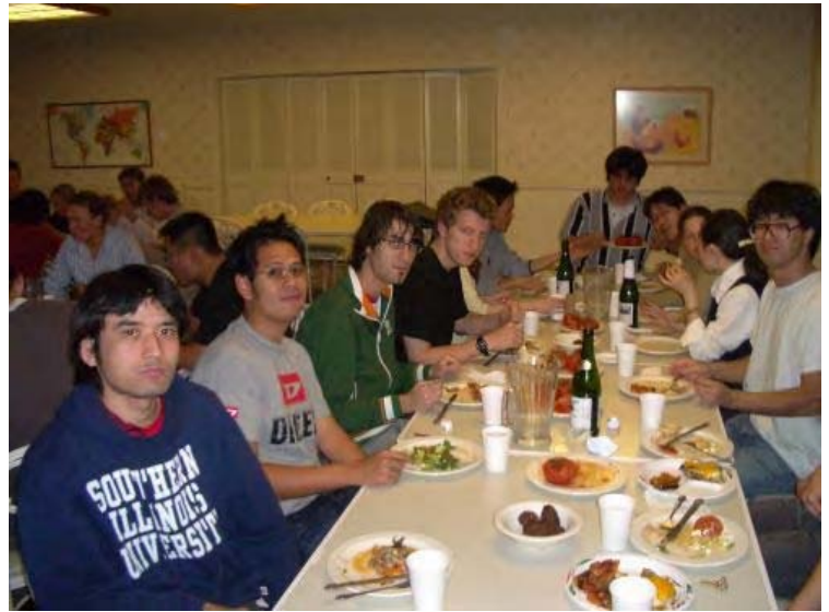
Residents from Japan, Thailand, Croatia, Indonasia, Taiwan, USA and Korea at Greek-Turkish Dinner, I-House (Spring 2005)

No matter how the politics are between those countries, there are still bonds between their citizens who have lived on the same land together for long time. I hope more opportunities and events like that will strengthen our relationships cause for many centuries we have dined at the same table and many more we shall.