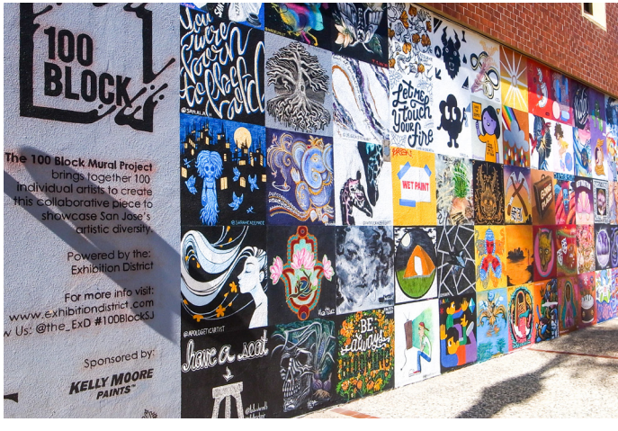
100 BLOCK MURAL MULTIPLE ARTISTS, 2020