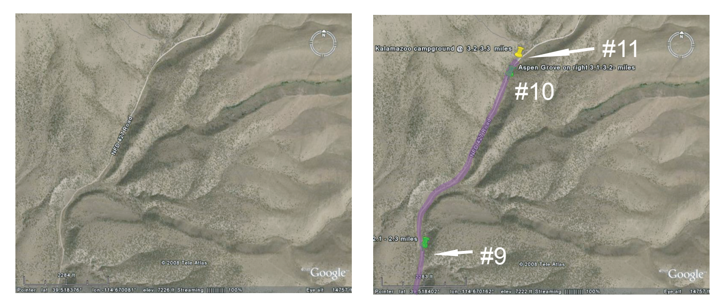
Figure 7 A.

9.) Between mile 2.1 and 2.3 there will be a road cut on the left going into camp. Watch out for rocks that have fallen into the road. Continue on this road.