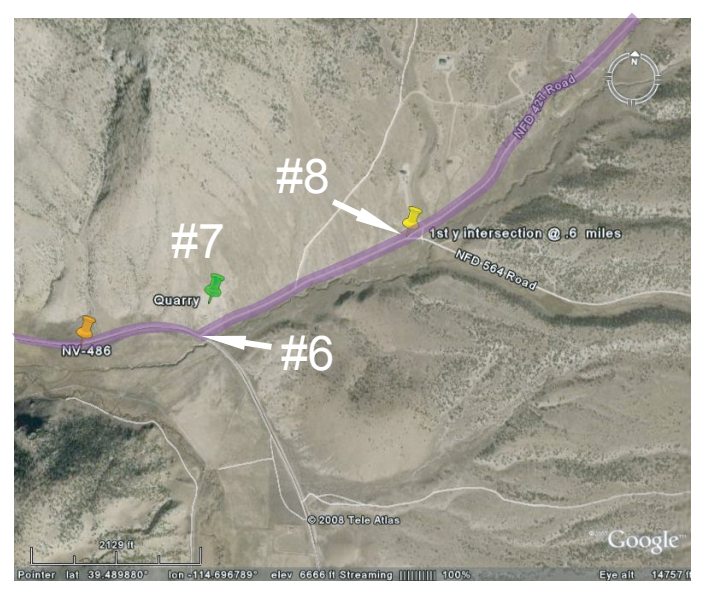
Figure 5 A.