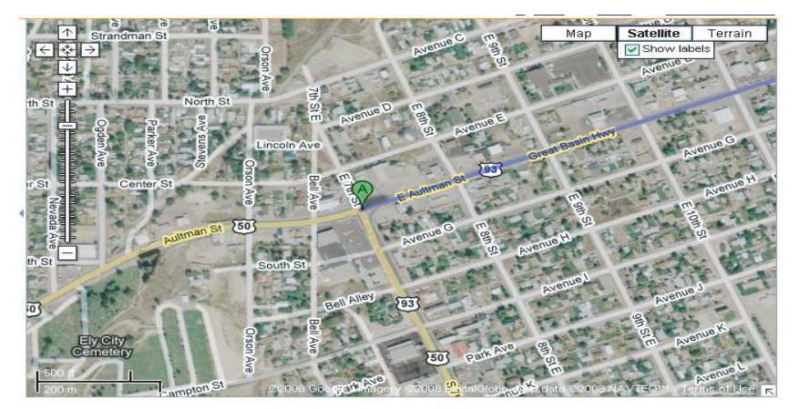
Figure 2. Google street map of Ely, Nevada. The green marker A is the starting point, Step #1.

WARNING: At this intersection HWY 50 turns right and continues to the Great Basin. (Do not turn this way to go to camp at Kalamazoo.)