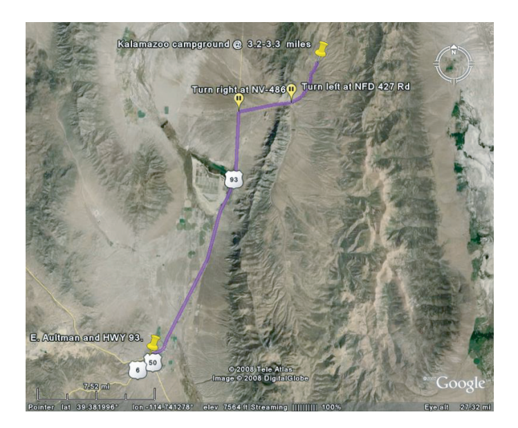
Figure 1. Google Earth image showing the full route from Ely to Kalamazoo.