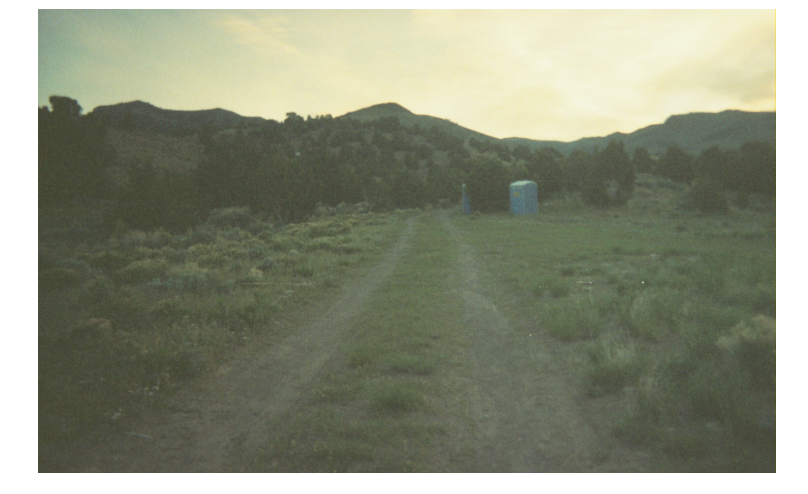
Figure 9. A picture from the Y intersection looking toward camp.

12.) As soon as you pass the Aspen Grove and veer left off the main road you'll see the porta-toliets. See Figure 9 for a picture from several years ago that shows the road and entrance into camp. Drive down the road and park on the first open area on the right. Avoid parking on the road or past the second tree line were the kitchen tent will be set up.