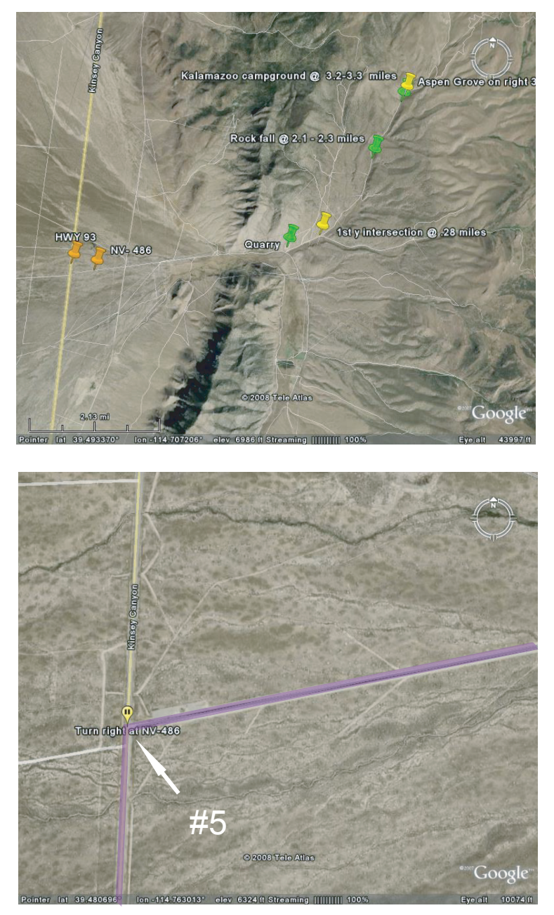
Figure 3. Google Earth image from 43,997 ft. This Satellite view shows themajor intersections starting at HWY 93 and NV 486 and all the way to the camp, shown with the large yellow thumb tack at the upper right of the figure. Green thumb tacks are points of interest or items to look out for.

5.) Turn right on to CR 29/Duck Creek Road/NV - 486. See Figure 3 and 4. Travel 3.4 miles to the Kalamazoo Summit Road (NFD - 427).