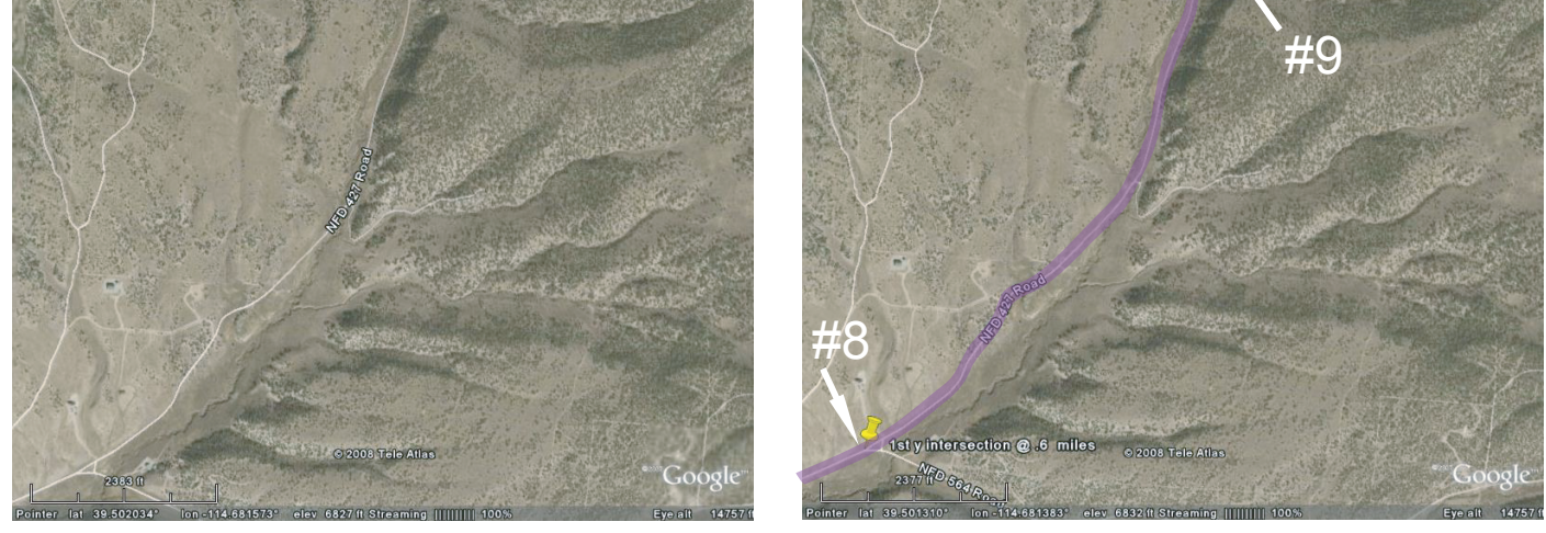
Figure 6 A.

8.) The first Y intersection is at mile 0.6. Stay on the main road but veer left. See Figures 5 and 6.