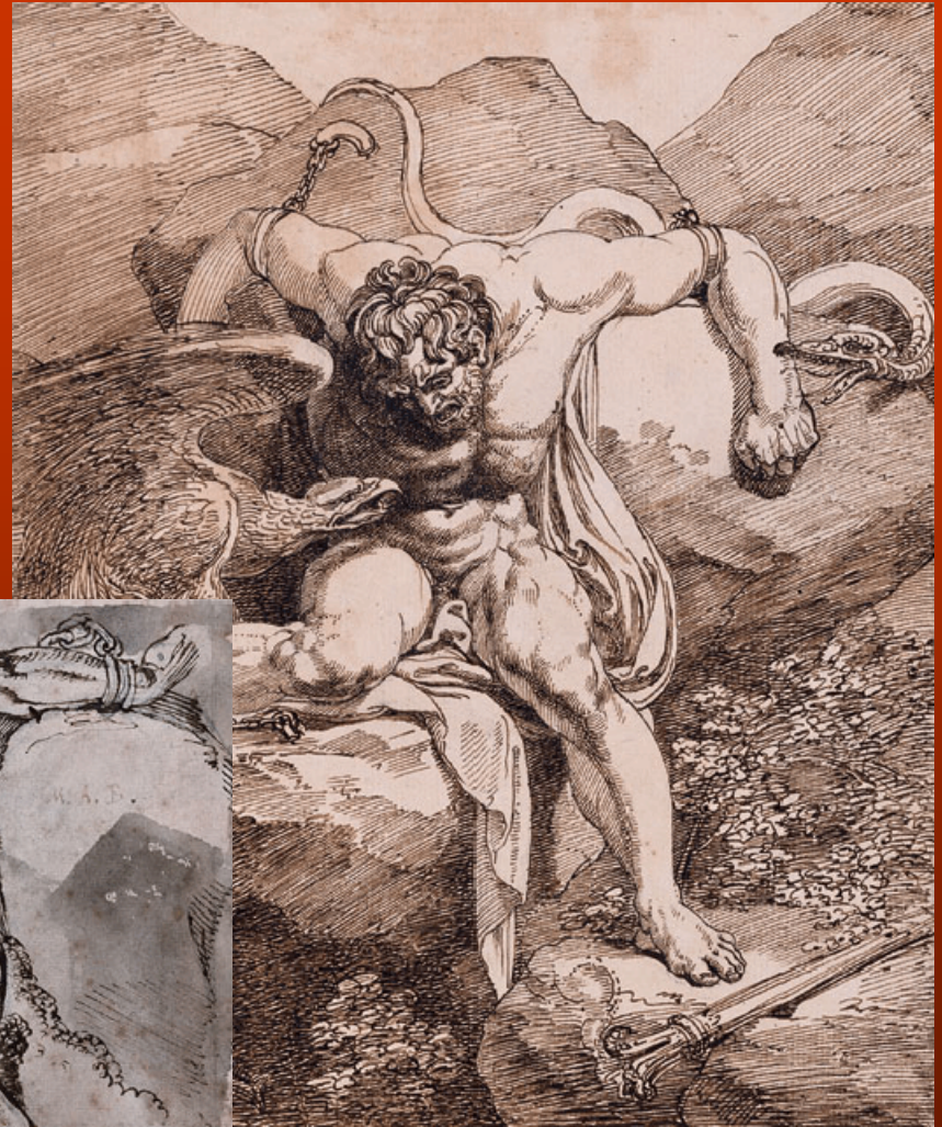
Henry Fuseli Prometheus 1770-1771