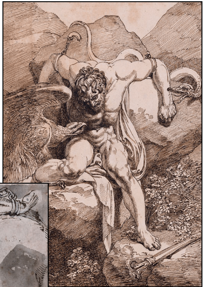
Richard Cosway Prometheus circa 1785-1800 Pen and brown ink on paper, 225 x 184 mm

Which Earth and Heaven could not convulse, A mighty lesson we inherit: Thou art a symbol and a sign To Mortals of their fate and force; Like thee, Man is in part divine, A troubled stream from a pure source; And Man in portions can foresee His own funereal destiny; His wretchedness, and his resistance, And his sad unallied existence: To which his Spirit may oppose Itself--and equal to all woes, And a firm will, and a deep sense, Which even in torture can descry Its own concentr'd recompense, Triumphant where it dares defy, And making Death a Victory.