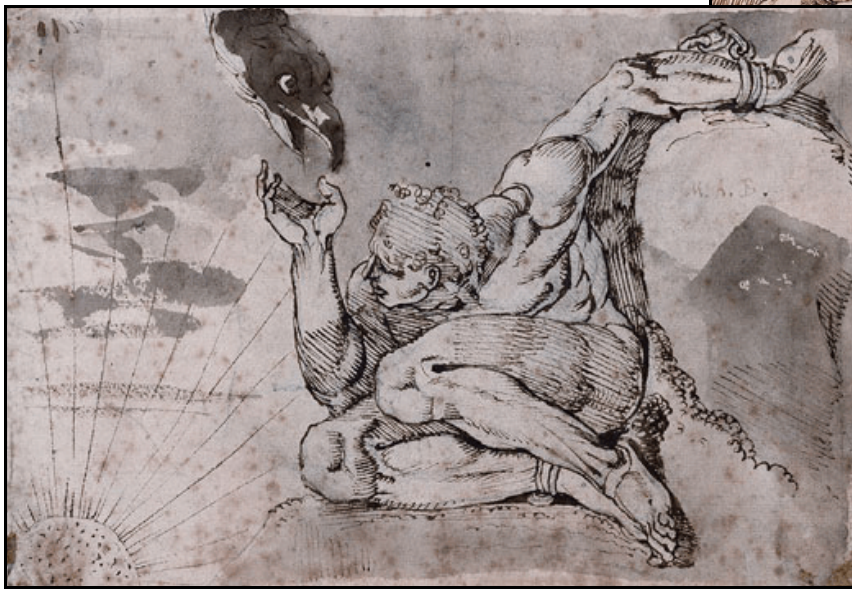
Henry Fuseli Prometheus 1770-1771 Pen and ink on paper, 150 x 222 mm