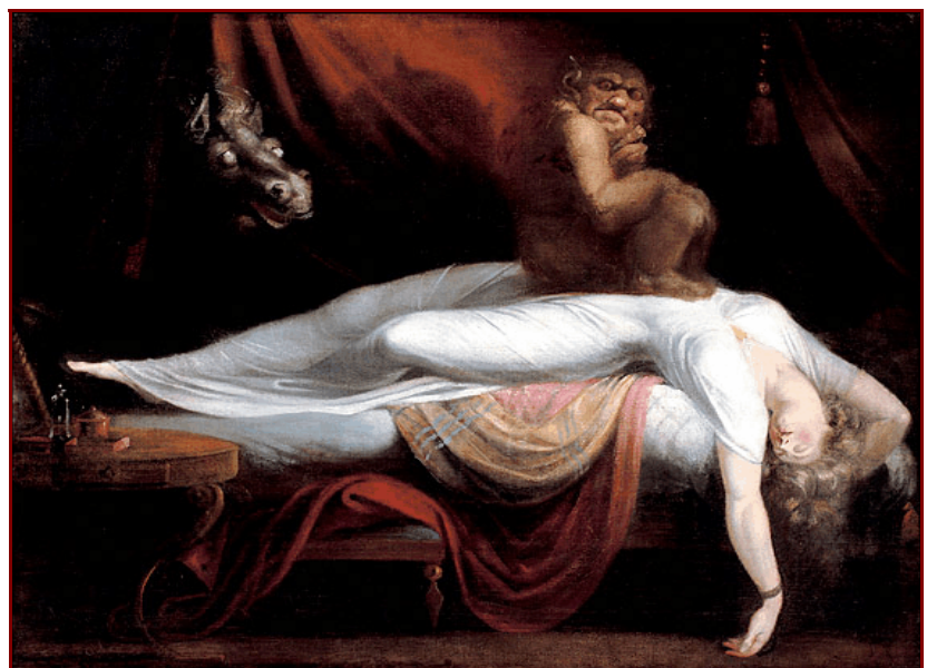
Fuseli's "The Nightmare" (1779; inspired by bad porkchop?) - inspiration for Frankenstein ? (Mary's mother had affair w/Fuseli)