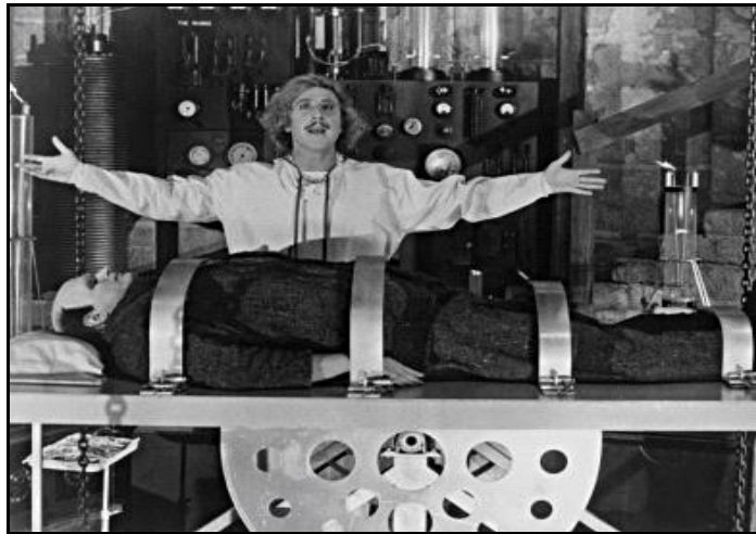
“Young Frankenstein” (Gene Wilder & Mel Brooks, 1974)

Previous page Images from “Gothic Nightmares,” Tate Britain online exhibit ( http://www.tate.org.uk/britain/exhibitions/gothicnightmares/rooms/room2.htm )