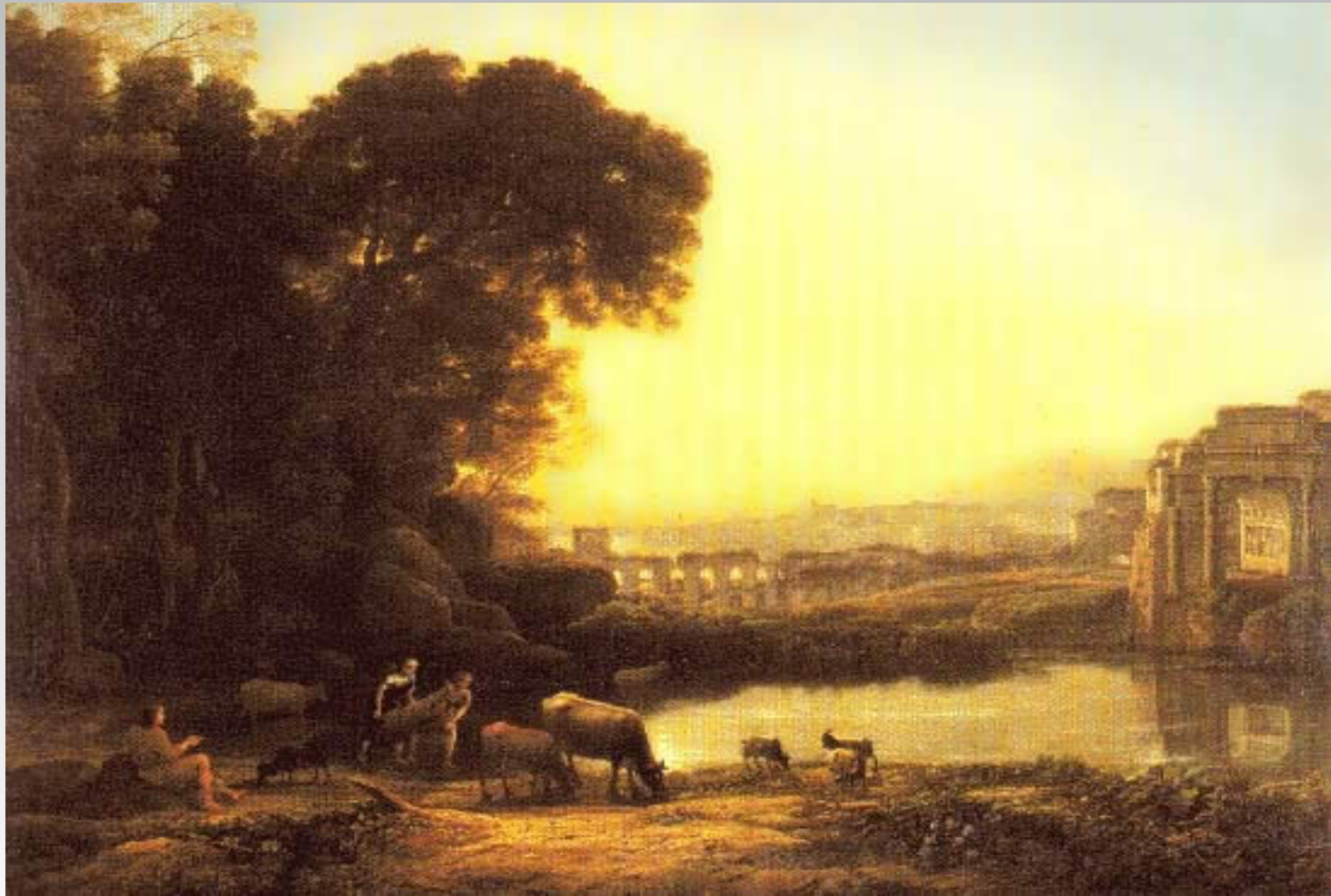
Claude Lorrain, Pastoral Landscape with the Arch of Titus