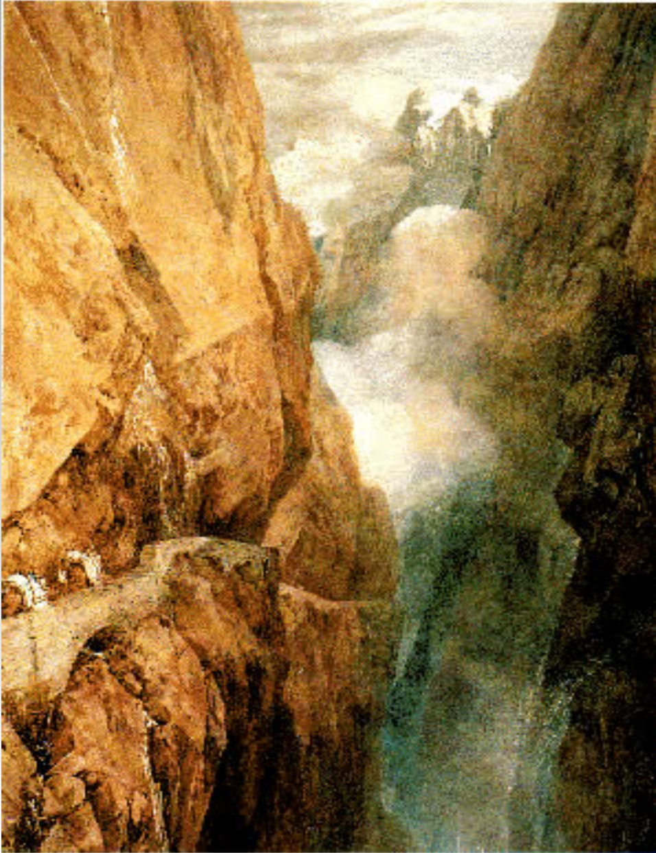
J. M. W. Turner, The Passage of the St. Gothard (1804). Watercolor