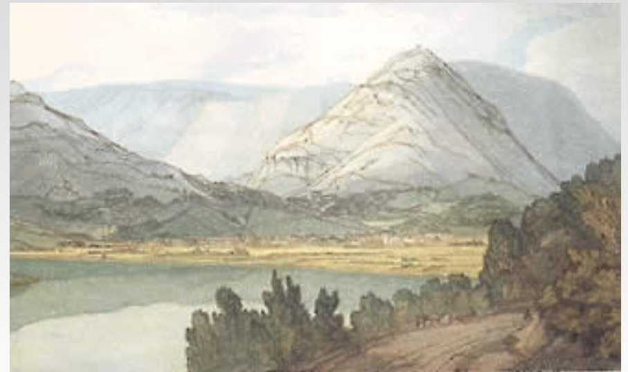
Ernest de Sélincourt, Grasmere . From Wordworth's Guide to the Lakes , Fifth Edition (1835)