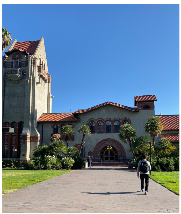
Tower Hall

Note: As the undergraduate newsletter, we include only graduate courses that are submitted by faculty members. For a full listing of graduate classes, please see the Graduate Newsletter or the online course catalogue.