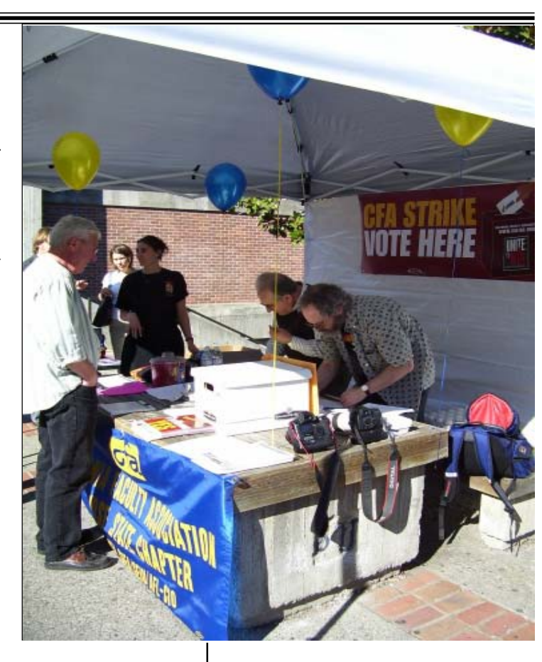
Teachers casting their ballots outside the student union

salaries are constantly behind and chasing the average cost-of-living in California. Not only will the CSU be at a disadvantage when recruiting new faculty, but it will also have a difficult time keeping the high-quality faculty it already has; it is not economically rational to stay in California if out-of-state universities can offer a better salary and feasible home-ownership possibilities. Additionally, inadequate faculty wages