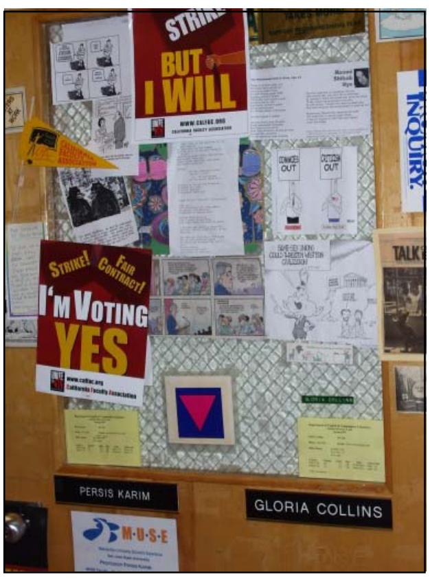
Professors' door showing support

All SJSU students, not only aspiring instructors in the English major, should be compelled to inform themselves of what is going on