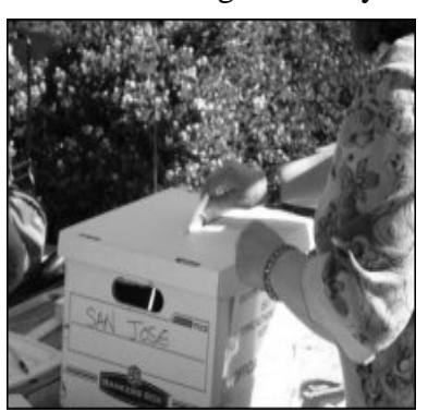
Anonymous professor casting a ballot

Update: Finally, there are fruits for the CFA's labor. As of April 3, 2007, the CSU announced that it has reached a tentative agreement with the CFA. The CFA will be provided a 20.7 percent increase of their base pay over a span of a four-year period, as well as step increases for eligible faculty.