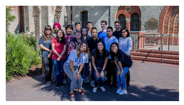
The H&A Marketing and Communications Team

English majors typically write and edit for the editorial staff, but students are free to apply for any position they wish; the H&A Marketing team is happy to teach a willing learner. So that there is an overlap in personnel, new interns sometimes train with current interns who are about to graduate. Anyone who enjoys writing and wants to develop their skills through this internship may provide samples of their work with their application.