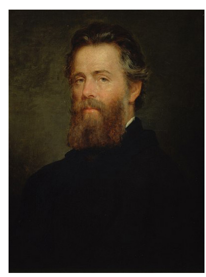
Herman Melville, 1870. Oil painting by Joseph Oriel Eaton