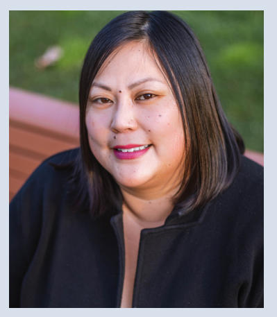
Ed.D. Program Analyst