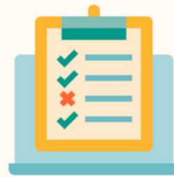
CSU Eligibility Requirements

EAP is happy to present to families, guardians, and parents!