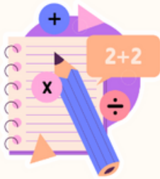
CSU Math/English Placement Process