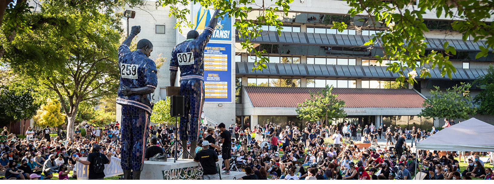
Our Social Justice Journey: School of Social Work Updates and Reflections